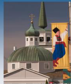
St. Michael Cathedral