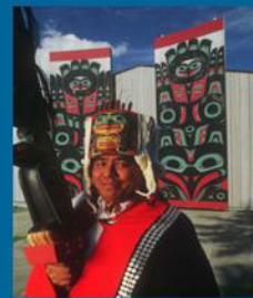
AK Native in front of the Sheet'ka Kwaan Naa Kahidi