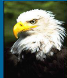
Alaska Raptor Center