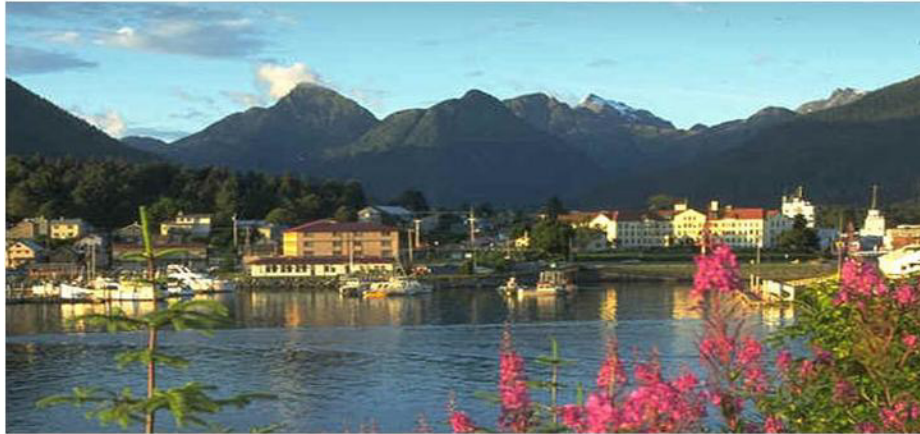
Downtown Sitka as viewed from Japonski Island.

Sitka is proud to offer a variety of facilities designed to meet your meeting needs. Traditional convention facilities, large marine vessels, even an ornately decorated native longhouse can provide the right venue for your organization in an unforgettable setting.